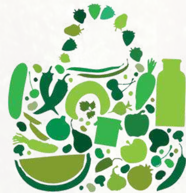
Hungary Szatyor Egyesület