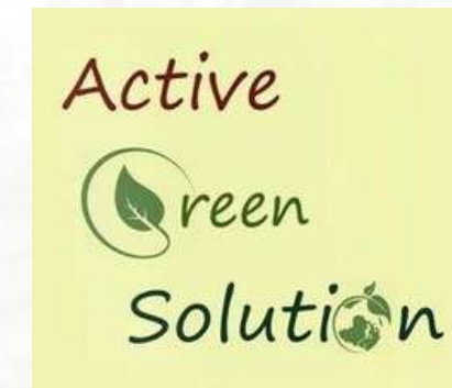
Greece Active Green Solution