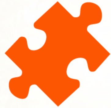
Germany Citizens of Europe