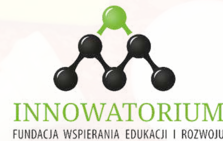
Poland Innowatorium Foundation