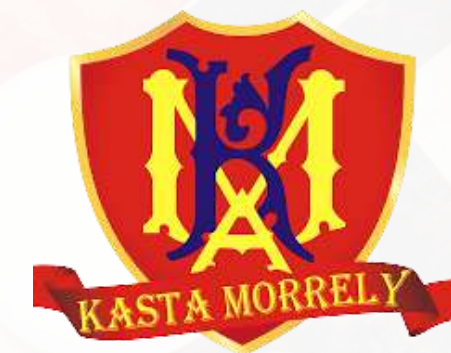
Romania Asociația Kasta Morrely