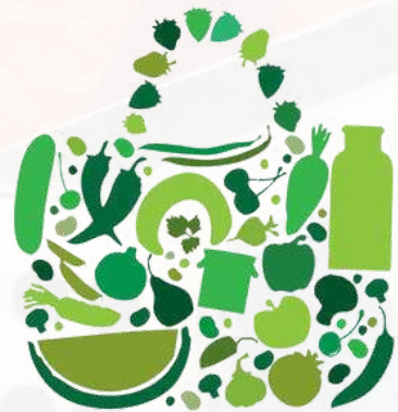
Hungary Szatyor Egyesület